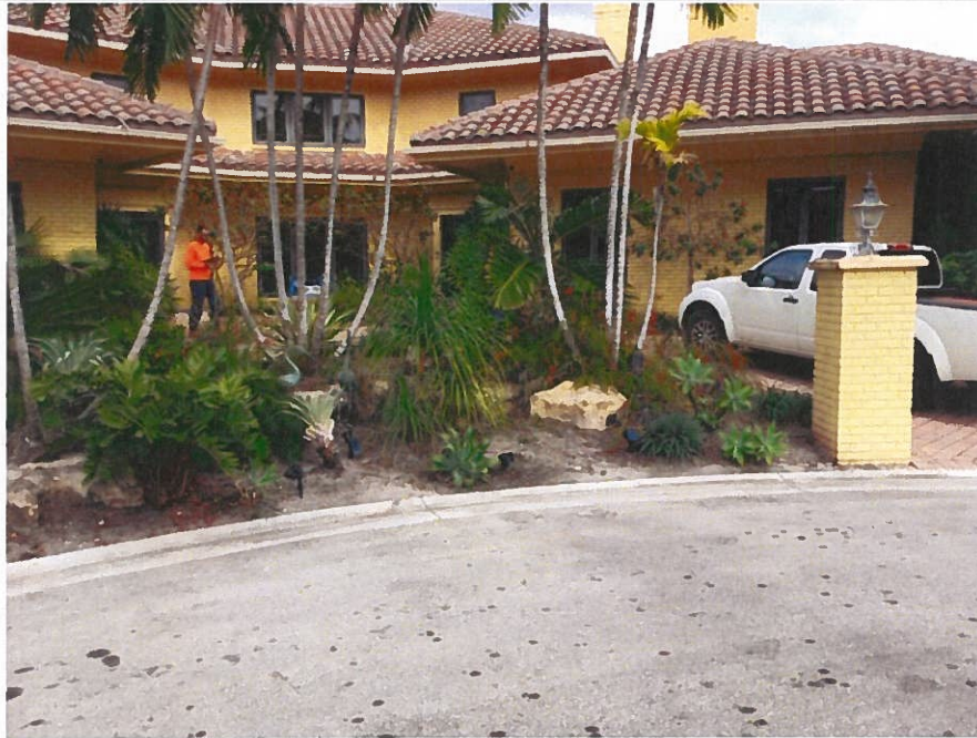
Photo One Caption: FRONT VIEW 03-01-2024

Instructions: Insert below at least two and when possible four photographs showing each side of the building (for example, may only be able to take front and back pictures of townhouses/rowhouses). Identify all photographs with the date taken and "Front View," "Rear View," "Right Side View," or "Left Side View." Photographs must show the foundation. When flood openings are present, include at least one close-up photograph of representative flood openings or vents, as indicated in Sections A8 and A9.