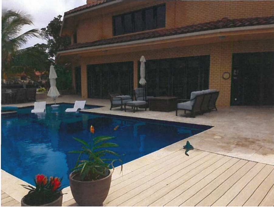
Photo Three Caption: REAR VIEW 03-01-2024

Insert the third and fourth photographs below. Identify all photographs with the date taken and "Front View," "Rear View," "Right Side View," or "Left Side View." When flood openings are present, include at least one close-up photograph of representative flood openings or vents, as indicated in Sections A8 and A9.