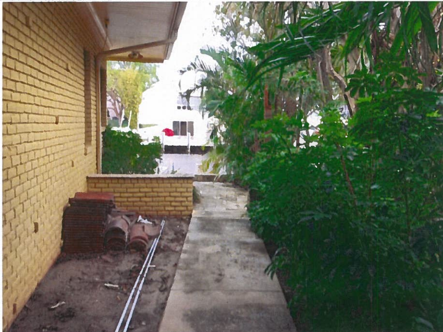
Photo Two Caption: RIGHT SIDE VIEW 03-01-2024