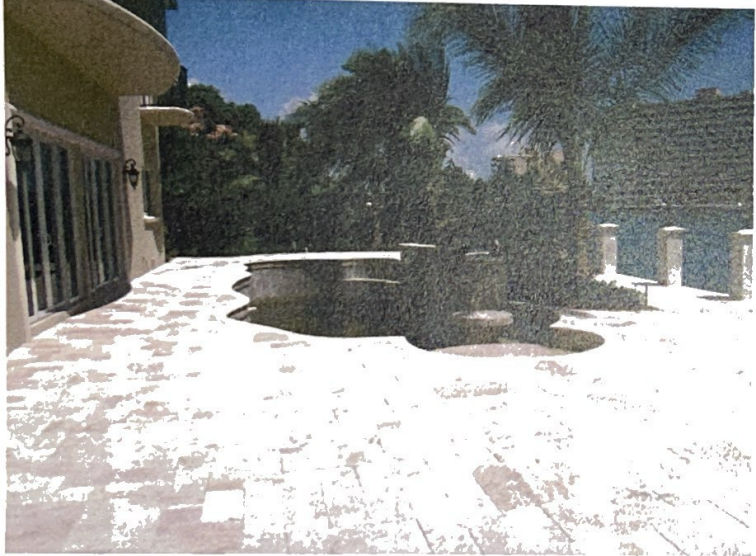
REAR VIEW 9/3/08