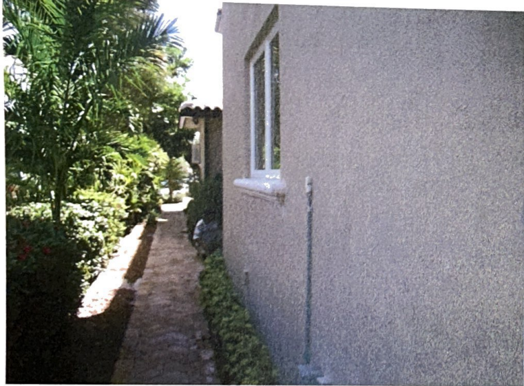
SIDE VIEW 9/3/08