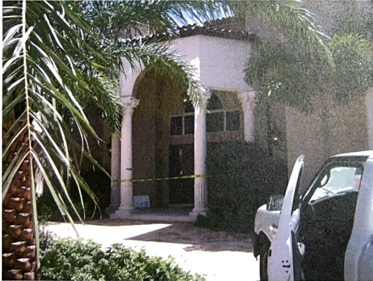
FRONT VIEW 9/3/08