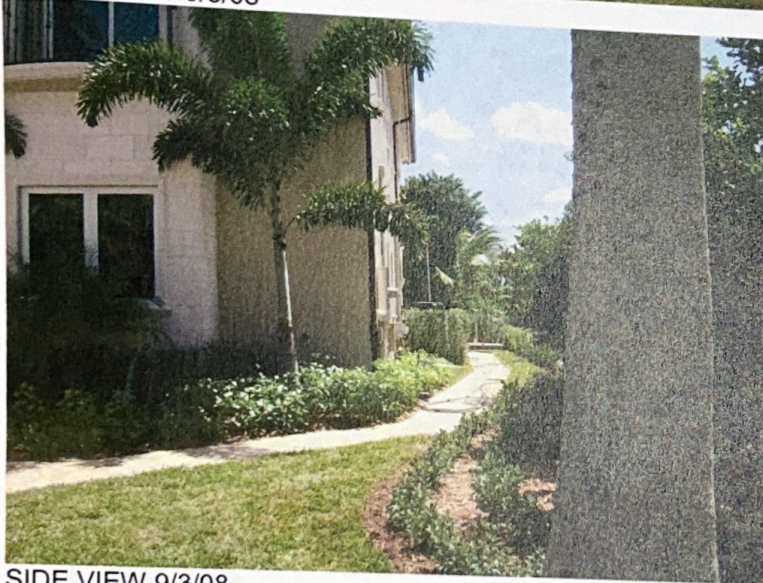
SIDE VIEW 9/3/08