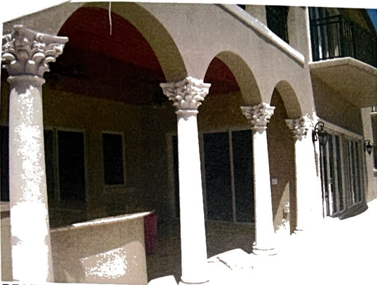
REAR VIEW 9/3/08