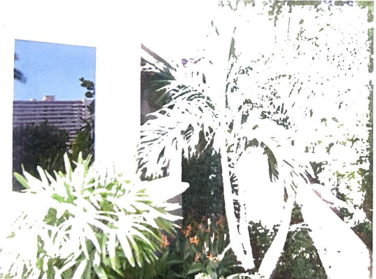
SIDE VIEW 9/3/08