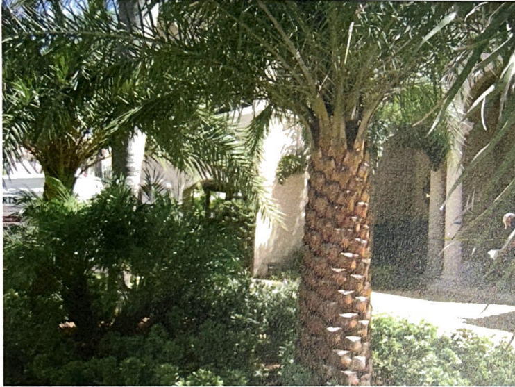
FRONT VIEW 9/3/08

If using the Elevation Certificate to obtain NFIP flood insurance, affix at least two building photographs below according to the instructions for Item A6. Identify all photographs with: date taken; "Front View" and "Rear View"; and, if required, "Right Side View" and "Left Side View." If submitting more photographs than will fit on this page, use the Continuation Page, following.