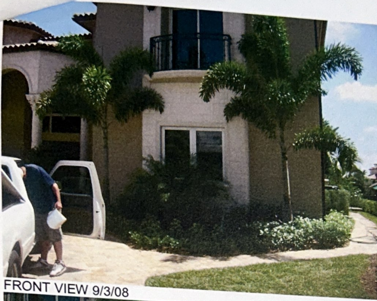
FRONT VIEW 9/3/08