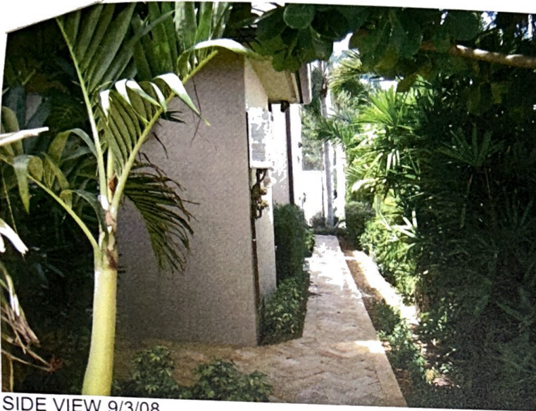
SIDE VIEW 9/3/08