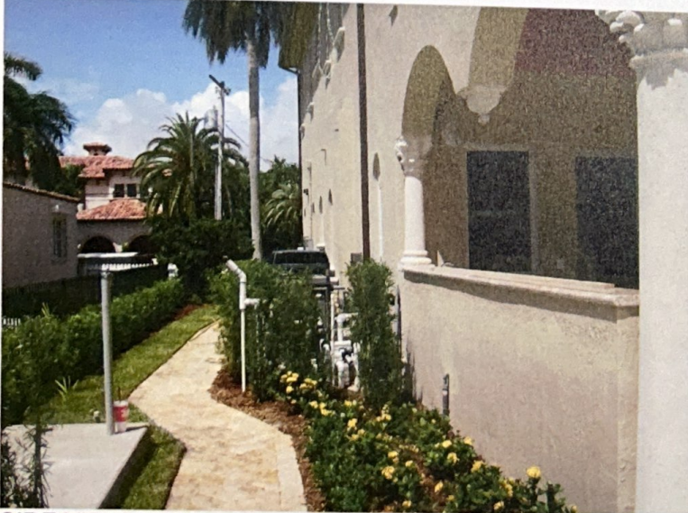
SIDE VIEW 9/3/08